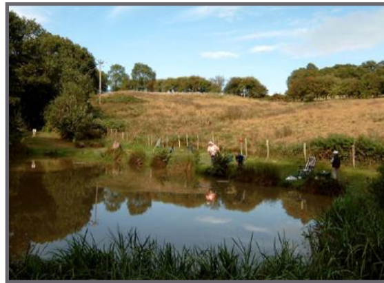
Top—A view of the fishing lake in the second field

The coarse fishing lake is small but well stocked. It is for campers use only and fishing is free for 2010, but normal conditions apply, remember to bring your own rod. Children should be supervised by a responsible adult here at all times.